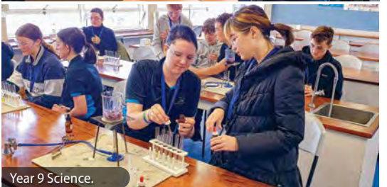
Year 9 Science.